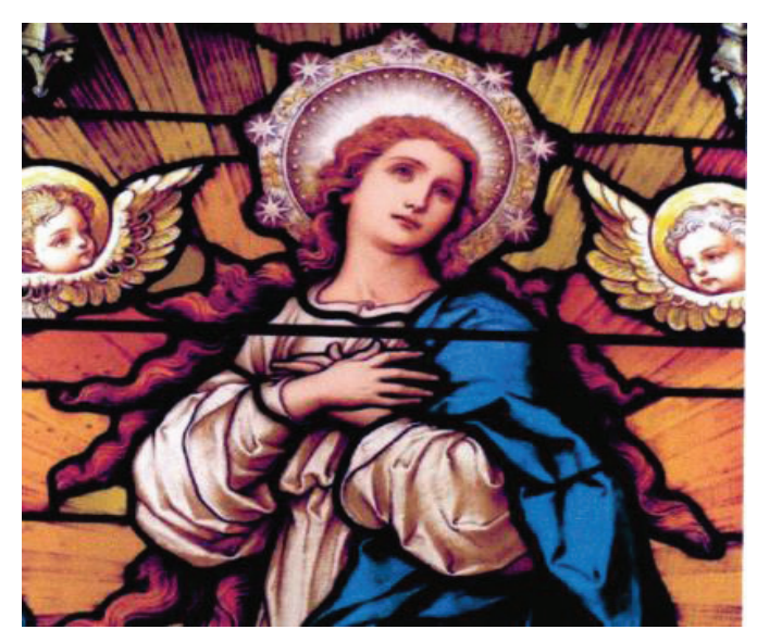
Thirty-eighth Annual Rosary Sunday

September 11, 2022 12 Noon- Outdoor Mass - 2:30- Procession, Rosary & Benediction