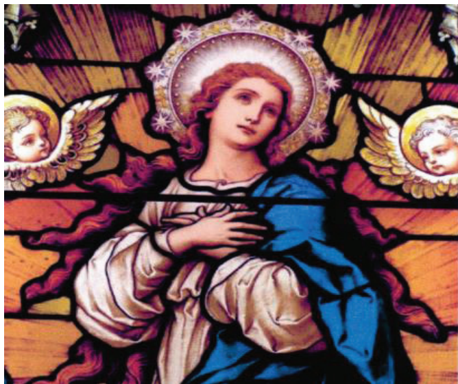
Thirty-eighth Annual Rosary Sunday

On Sunday, September 11, there will be Rosary Sunday at the Martyr's Shrine in Midland.