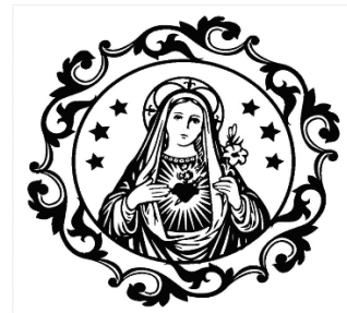
Immaculate Heart of Virgin Mar...

Mother, keep me, a sinner, constantly bathed in the light of your Immaculate Heart. Amen